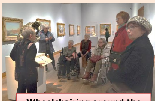
Wheelchairs around the Museum of Fine Arts

Seniors also went shopping, bringing smiles of appreciation all around.