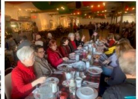
Sortie du printemps à la Cabane à Sucre de la Famille Constantin à Saint-Eustache Les ami/es du Café-Rendez-Vous-Y du YMCA du Parc - 22 mars 2023